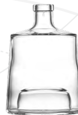
NAOS 700 ml