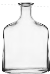
LEONIS 700 ml