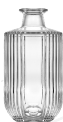
LYRA VINTAGE 500 ml, 700 ml