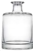
JUPITER 500 ml, 700 ml