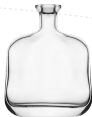
PANDORA 700 ml