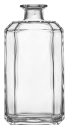
SIRIUS 50 ml, 500 ml, 700 ml