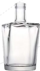
PHOENIX 700 ml