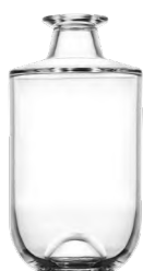
LYRA 200 ml, 500 ml, 700 ml