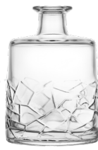
JUPITER POLARIS 700 ml