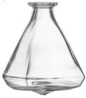
VORTEX 700 ml