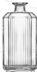
SIRIUS VINTAGE 700 ml