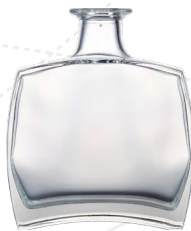
CALLISTO 500 ml, 700 ml, 750 ml